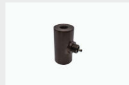
LAB-102 Micro, Quick Connect Bollard T-Mount