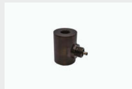
LAB-101 Micro, Quick Connect Bollard L-Mount