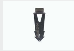
LAP-006 8" Spike with Quick Connect