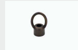
LAB-035 Micro Light Mounting, Hanging Mount