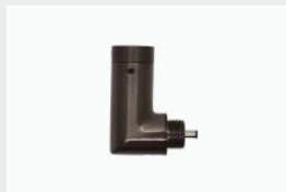
LAB-083 Nano, Quick Connect L-Mount