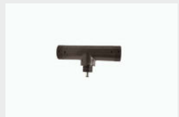
LAB-084 Nano, Quick Connect T-Mount