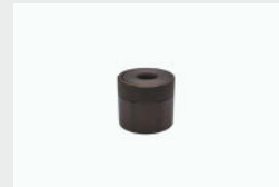
LAB-076 Micro, Quick Connect Junction Box