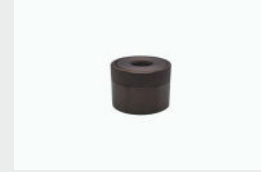
LAB-077 Macro Quick Connect Junction Box Brass